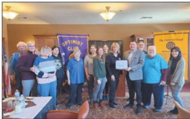
The Optimist Club of West Bend receives a proclamation from West Bend Mayor Joel Ongert for International Optimist Day