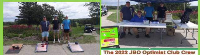
The 2022 JBO Optimist Club Crew