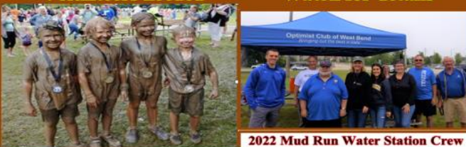
2022 Mud Run Water Station Crew