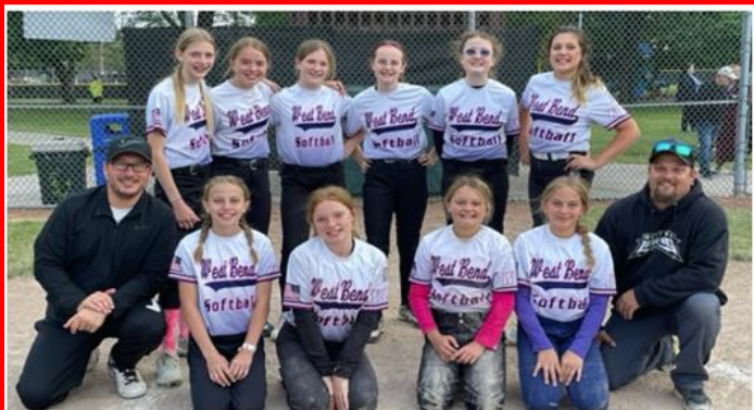
Optimist Club's West Bend Girls' Softball Team