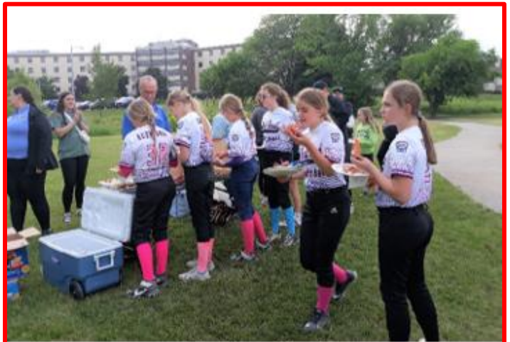
It's Pizza Time!