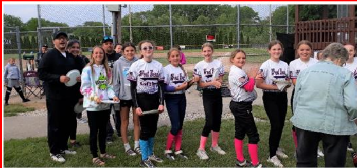
The team lining up to get their pizza