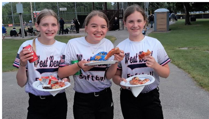
Showing off their Optimist Club uniforms