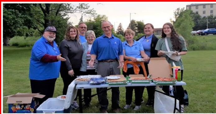
Optimist Club members preparing for the Pizza Party

On June 12th, our Club again hosted a PIZZA PARTY for the team we sponsor through the West Bend Little League Program – a Girls' Softball Team. Our girls team won their game just before their Pizza Party. Keep it up girls! It is always wonderful to see good kids in action. A fun time was had by all!