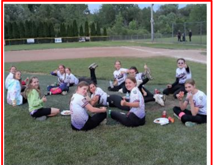
Enjoying their pizza on the infield